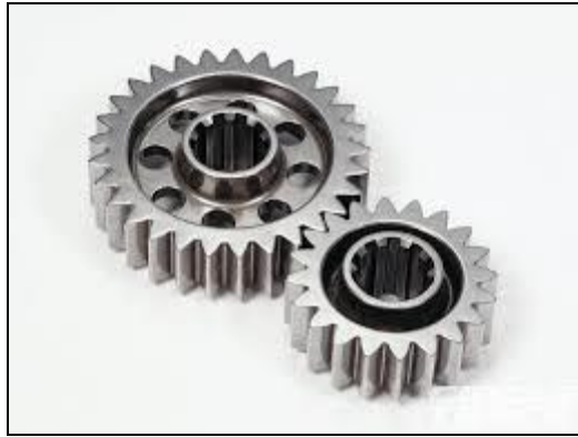
Fig1: Typical Gear used for Power transmission