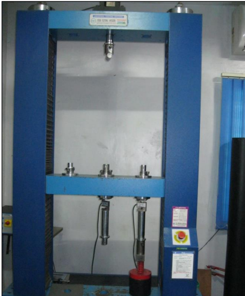
Fig.No.2 Experimental Setup_ Universal Testing Machine

Strain gauge positioned with the terminal