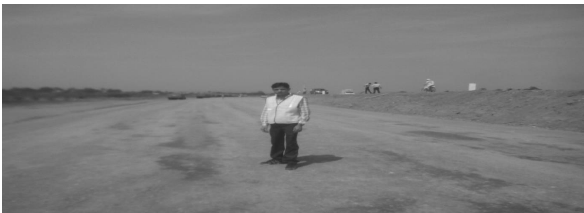
Fig. No.1 Fly Ash Embankment Construction

Fly ash is a fine –grained material with practically no cohesion. However, when the fly ash in wet state is left undisturbed for a long period, development of some apparent cohesion has been observed. In view of its compatibility and development of apparent cohesion leading to strength development over a period of time, it is possible to use fly ash as a fill material in low lying areas and also in the construction of embankments.