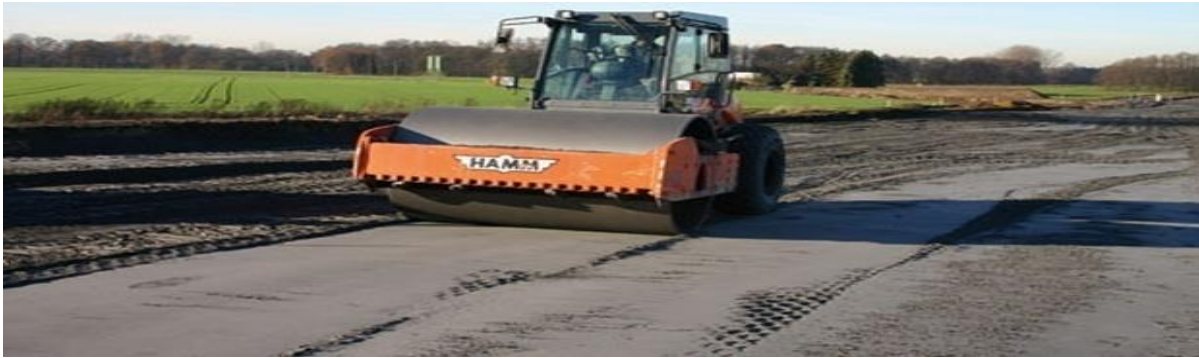
Fig No. 3 Grading & Compaction of Fly Ash for Embankment Construction