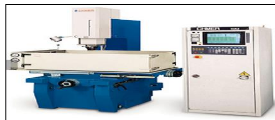
Figure.2 Typical Test setup for EDM Process & specifications