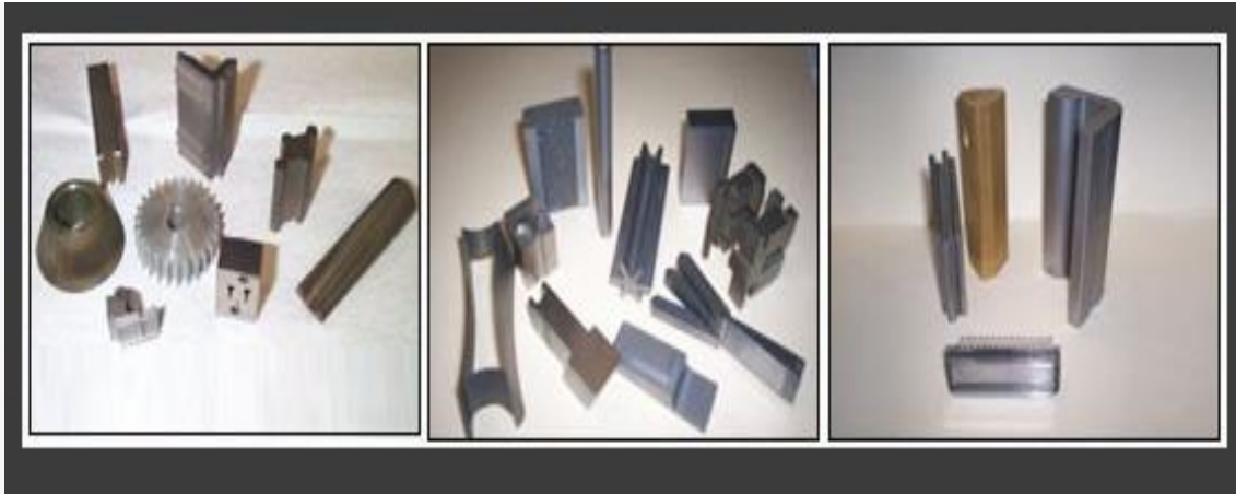
Figure 1: Parts manufactured using EDM